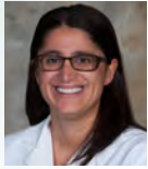
Dr. Mona Hanna-Attisha

Dr. Mona Hanna-Attisha , Director of Pediatric Residency at Hurley Children's Hospital, continues to be one of the most sought after interviews by the media. Dr. Hanna-Attisha and Hurley researchers discovered an increase in elevated blood lead levels (EBLs) in children across Flint, after the city switched to the Flint River for drinking water without the addition of necessary corrosion control. The city has since switched back to Detroit's Water system, but Dr. Hanna-Attisha says filters still need to be used. In addition to the hundreds of media outlets that have picked up this story, Dr. Hanna-Attisha receives more interview requests nearly every day from local, state, national and international outlets. Of the most notable recent outlets include CBS Evening News, USA Today, Rolling Stone Magazine, WXYZ in Detroit, Detroit News, Detroit Free Press, NPR, the American Academy of Pediatrics, and Al Jazeera.