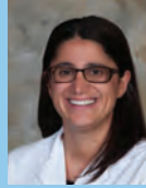
Dr. Hanna- Attisha Mona

News about Flint's water crisis continues to dominate news headlines. Marc Edwards, M.S., Ph.D., Charles Lunsford Professor of Civil Engineering at Virginia Tech delivered Pediatric Grand Rounds at Hurley Children's Hospital on December 2nd. His presentation was called "The Washington D.C. Lead Crisis (2001-2004): Prelude to Flint 2015." Similar to the events unfolding in Flint's current lead in drinking water crisis, the 2001-2004 Washington D.C. lead in drinking water crisis is a case study in the history of engineering and scientific misconduct. As in Washington D.C., Dr. Marc Edwards led the water research that revealed Flint's drinking water crisis. Dr. Edwards' research findings prompted Dr. Hanna-Attisha to investigate elevated blood lead levels in Flint children. Their combined research is credited with the switch back to Detroit's Water System. The story was featured on ABC12, WNEM TV5, NBC25, and the Flint Journal.