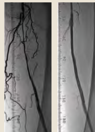
63-year-old male diabetic Preprocedure Postprocedure

The FDA recently announced approval of the new device, made by Cook Medical and is made available to only a select few centers in the country. The minimally invasive procedure is performed inside the Hurley Cardiovascular Laboratory.