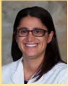
Dr. Mona Hanna-Attisha

Hundreds of media outlets from around the world, country, state and Mid-Michigan covered the alarming results of a recent analysis of blood lead levels that indicate lead overexposure in Flint children. The results were released at a press conference at Hurley Medical Center on September 24th.